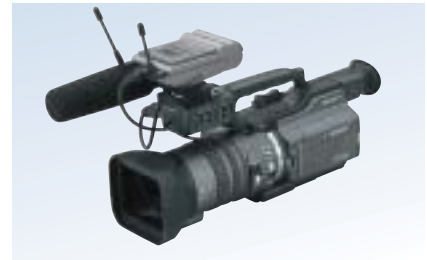
Photo shows portable tuner mounted on a DSR-PD150.