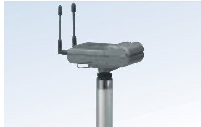
Photo shows portable tuner mounted on a microphone stand.